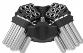
Cat. No. # LC01-L30-140 Capacity: 32 x 10 ml RCF: 3164 g