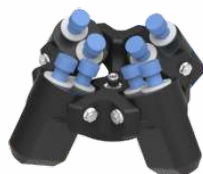
Cat. No. # LC01-L30-127 Capacity: 8 x 15 ml RCF: 3440 g