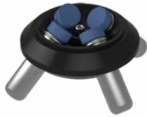
Cat. No. # LC01-L30-135 Capacity: 4 x 50 ml RCF: 2644g