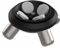
Cat. No. # LC01-L30-136 Capacity: 4 x 100 ml RCF: 2559 g