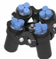
Cat. No. # LC01-L30-126 Capacity: 12 x 15 ml RCF: 3485 g