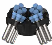
Cat. No. # LC01-L30-125 Capacity: 16 x 15 ml RCF: 3485 g