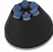
Cat. No. # LC01-L30-134 Capacity: 6 x 50 ml RCF: 2644 g