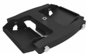
Cat. No. # LC01-L30-124 Capacity: 2 x PCR Plates RCF: 2355 g