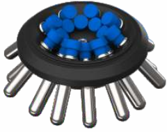
Cat. No. # LC01-L30-131 Capacity: 16 x 15 ml RCF: 3144 g