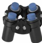
Cat. No. # LC01-L30-129 Capacity: 4 x 50 ml RCF: 3485 g