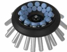
Cat. No. # LC01-L30-137 Capacity: 24 x 15 ml RCF: 2852 g