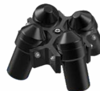
Cat. No. # LC01-L30-130 Capacity: 4 x 100 ml RCF: 3164 g