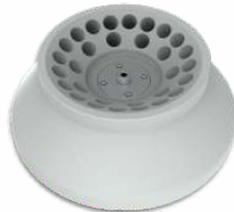
Cat. No. # LC01-L30-138 Capacity: 30 x 15 ml RCF: 2729 g