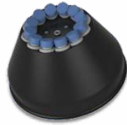
Cat. No. # LC01-L30-132 Capacity: 12 x 15 ml RCF: 3144 g